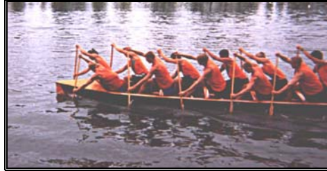
The 2001 Juvy War Canoe