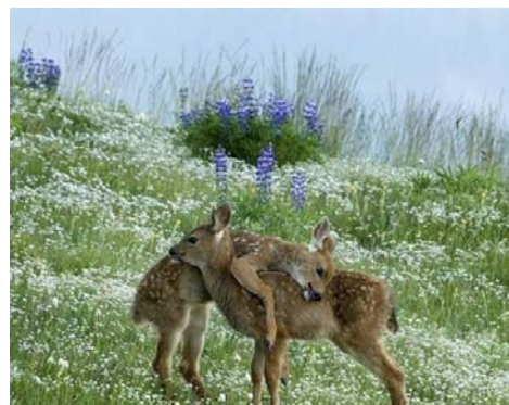
Back Field at Chikopi