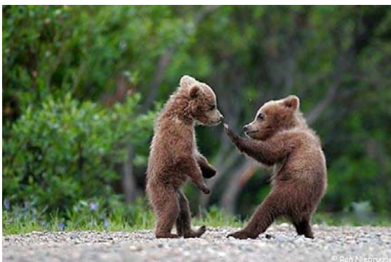
Spring Bear Cubs near Chikopi

These photographs, taken at Chikopi were sent to us this week, awwwww!!!!